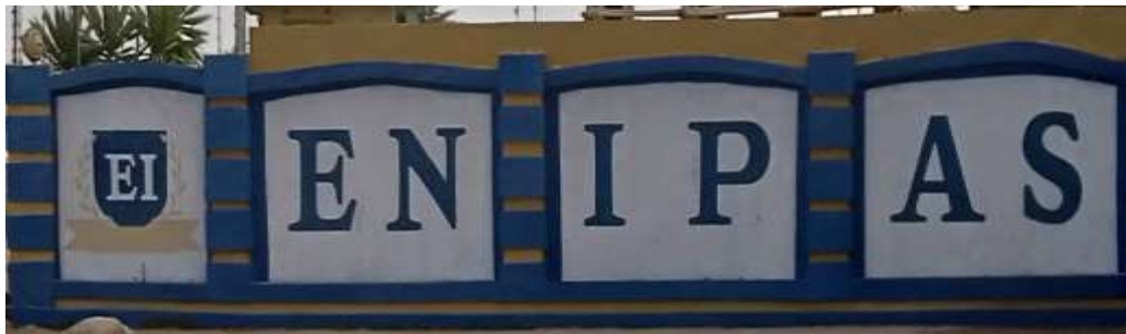
Entrance to the school