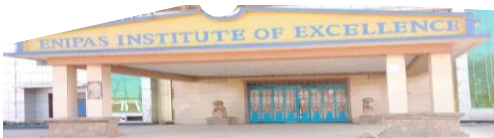
Student transport and utility vehicles